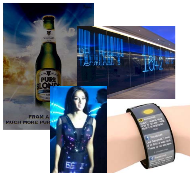
Figure 2. Example applications of highly energy efficient electroluminescent materials used in modern displays.